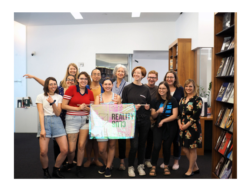
image 1. cosmOS from Space space image 2. Crystal Growing Kit for Crystal Growing Party image 3. Spencer Art Reference Library, Book Tour No. 2