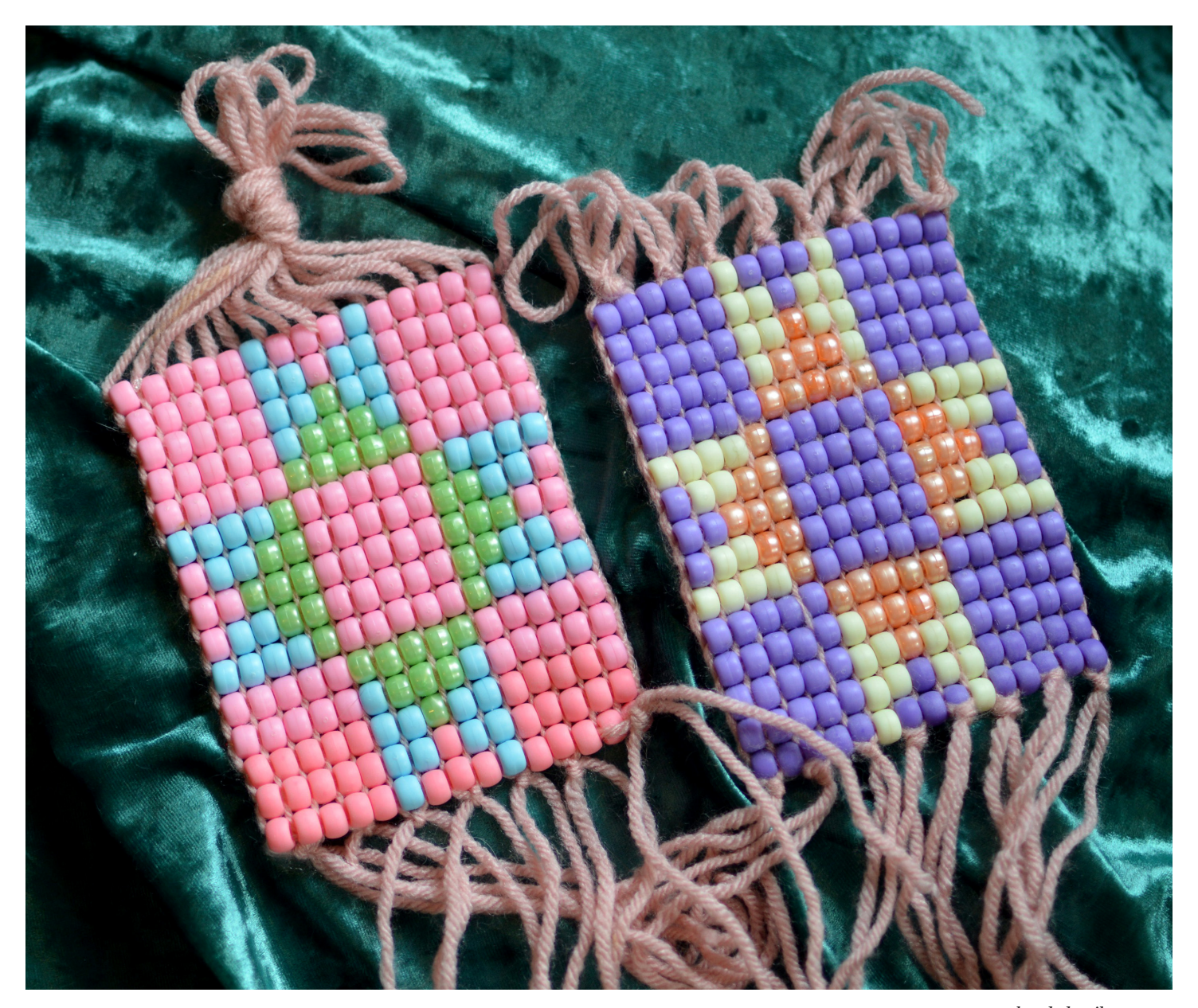
beaded quilt squares

Bless your Heart is an interaction, a gift, and a community.