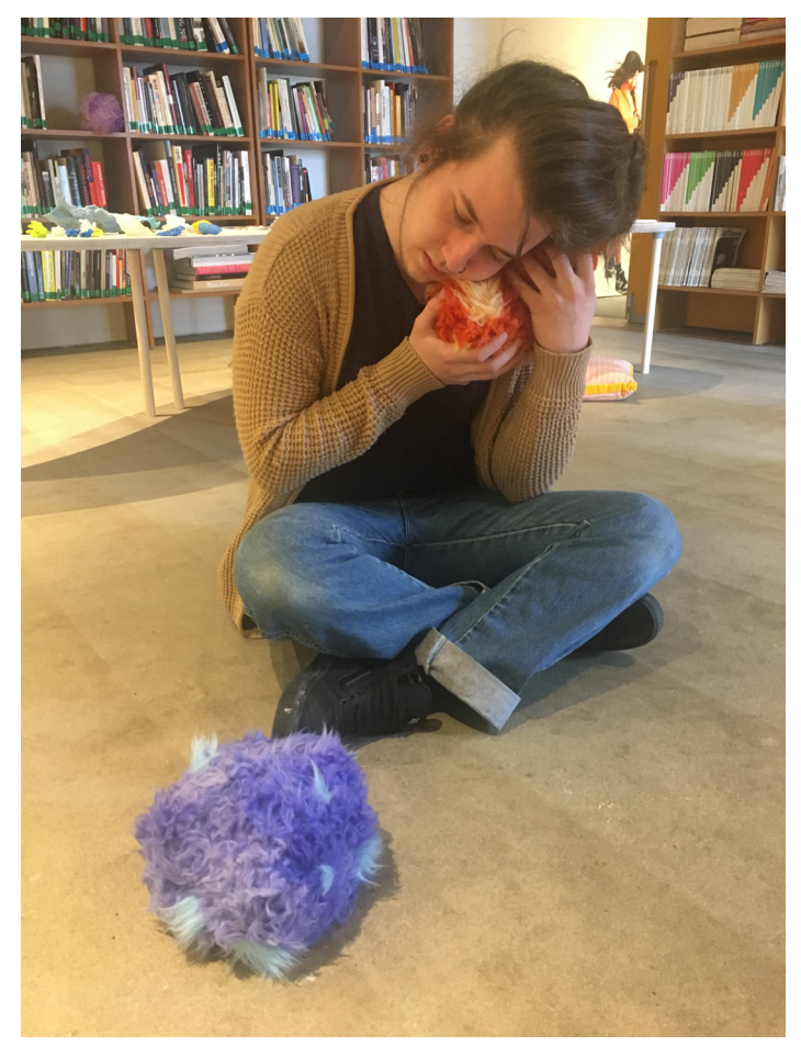
figure 1: Soft Spots on the shelves of H&R Bloch Artspace