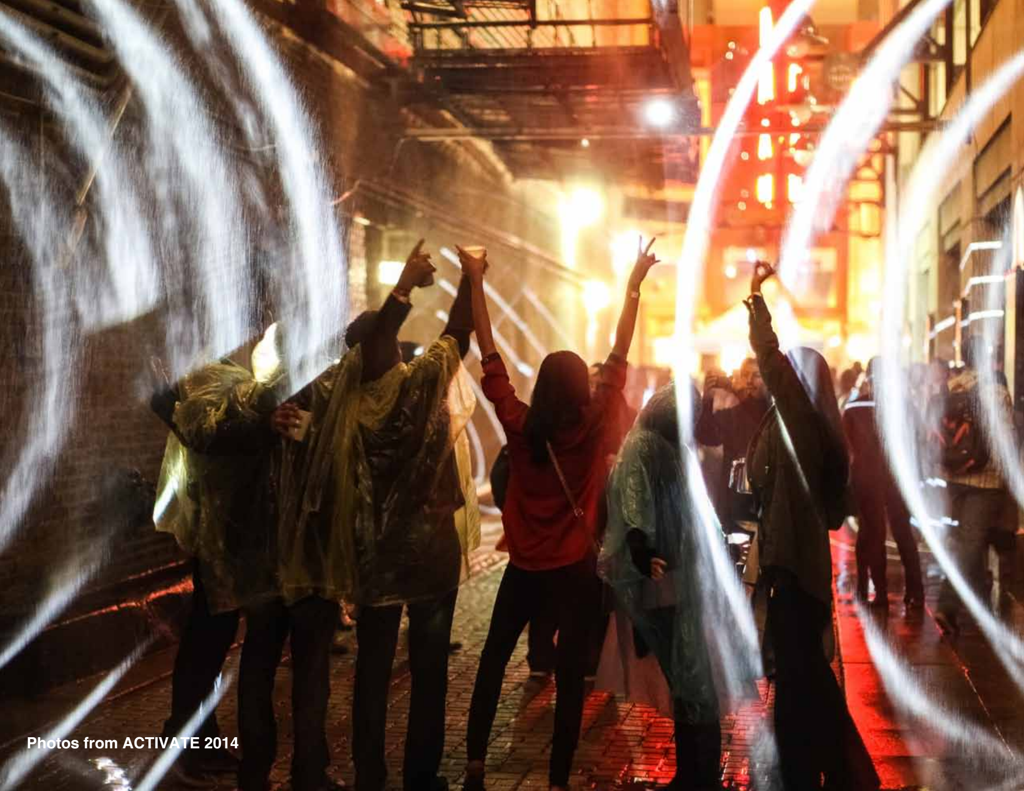
Photos from ACTIVATE 2014