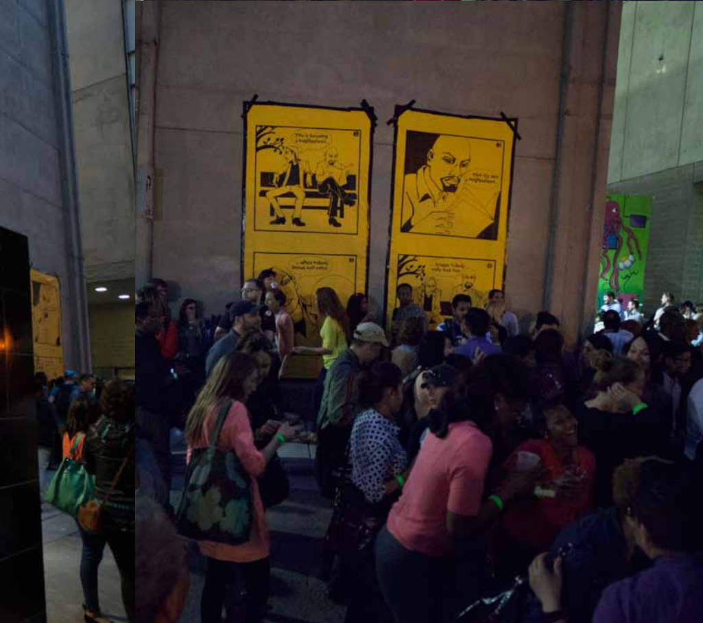
Photos from ACTIVATE 2014