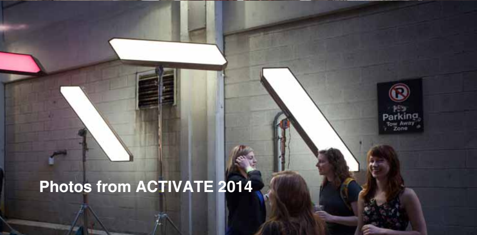
Photos from ACTIVATE 2014