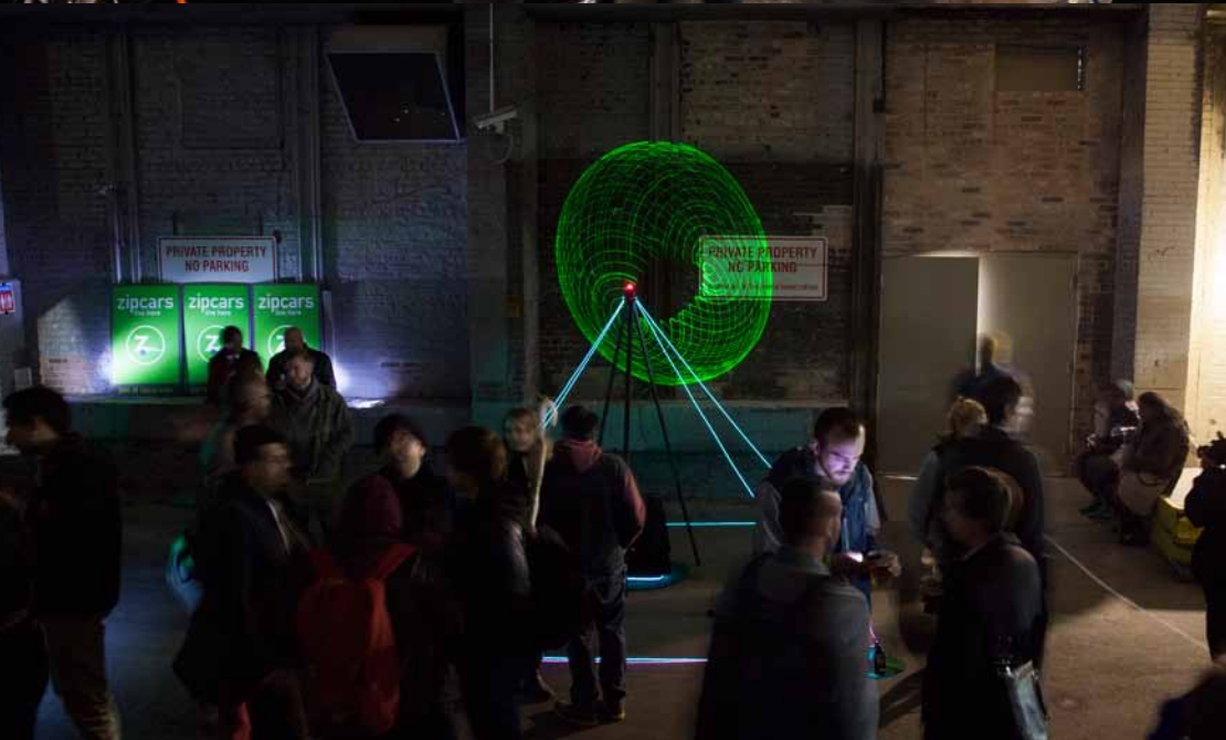
Photos from ACTIVATE 2014