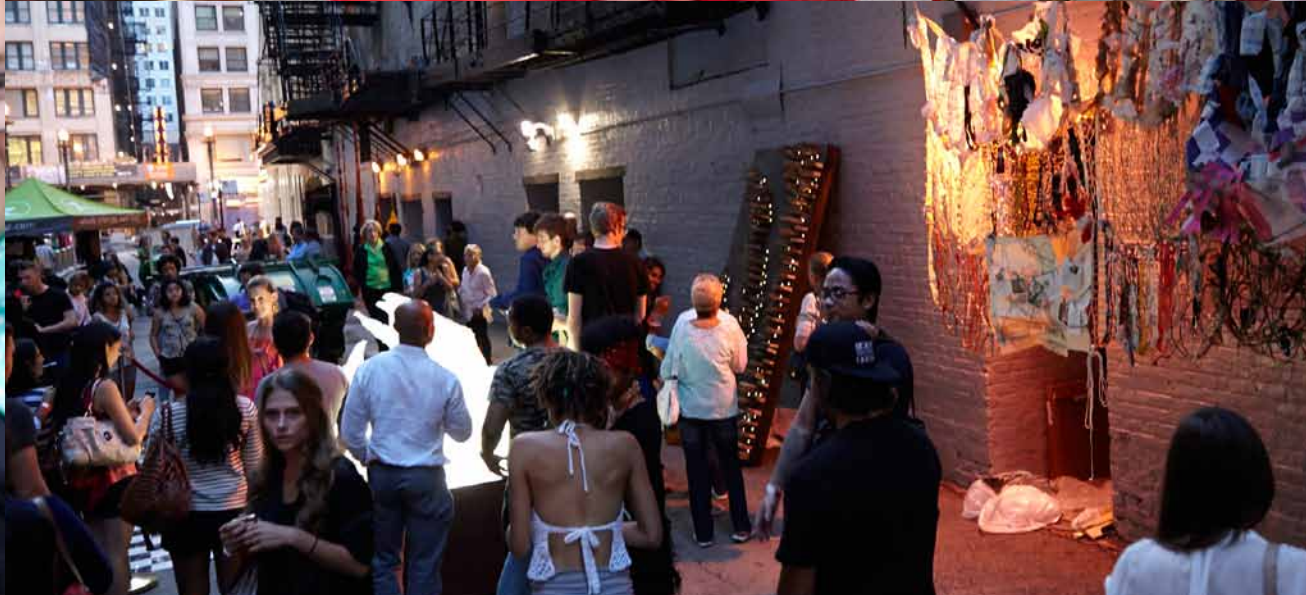
Photos from ACTIVATE 2014