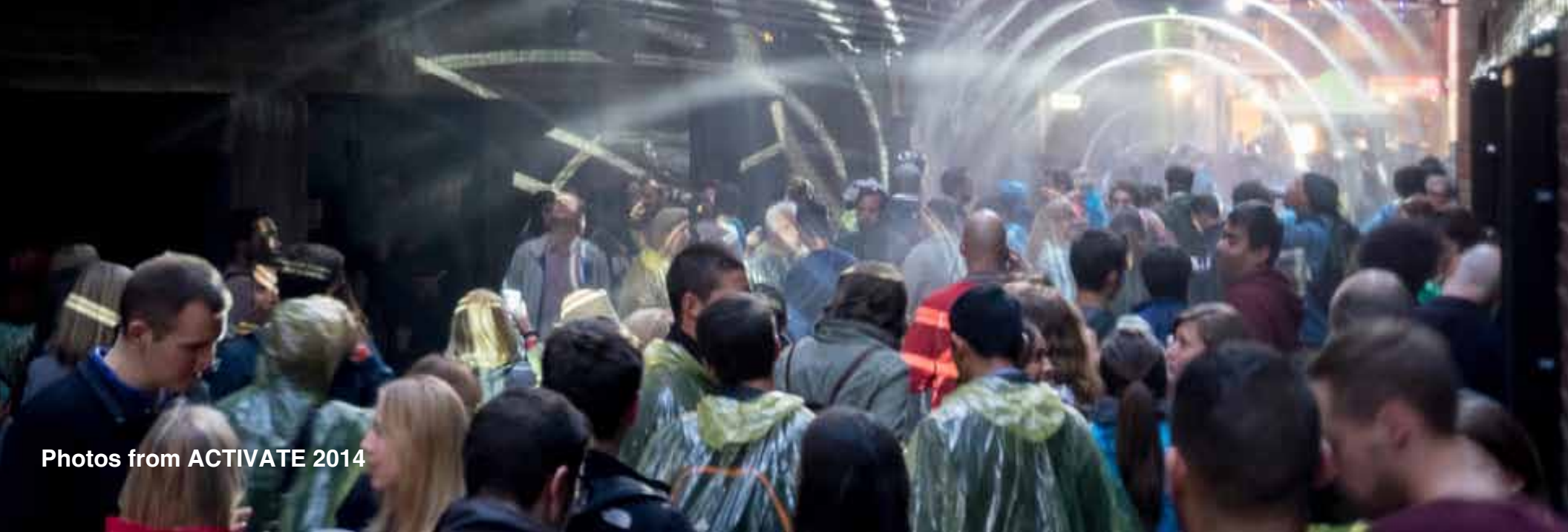
Photos from ACTIVATE 2014