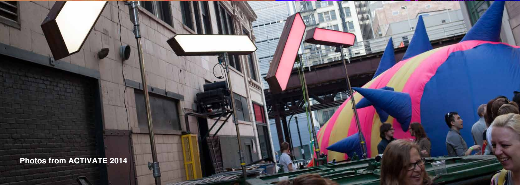
Photos from ACTIVATE 2014